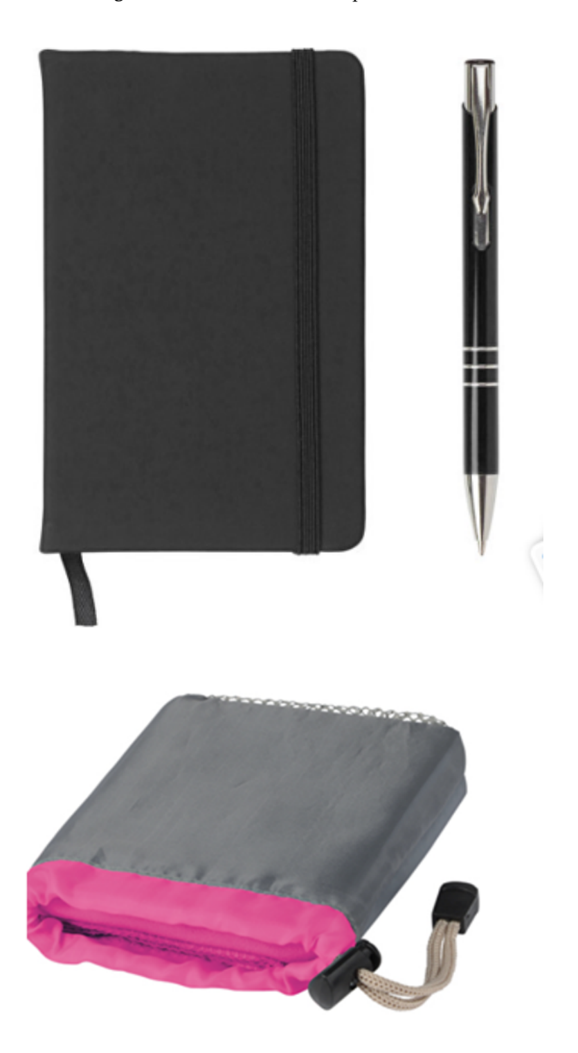
Figure A1: Items used in the experiment